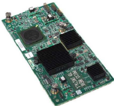
Figure 1. Cisco UCS M71KR-Q QLogic Converged Network Adapter

Designed specifically for the Cisco UCS blades, the adapter provides a dual-port connection to the midplane of the blade server chassis. The Cisco UCS M71KR-Q uses an Intel 82598 10 Gigabit Ethernet controller for network traffic and a QLogic 4-Gbps Fibre Channel controller for Fibre Channel traffic, all on the same mezzanine card. The Cisco UCS M71KR-Q presents two discrete Fibre Channel host bus adapter (HBA) ports and two Ethernet network ports to the operating system (Figure 1).