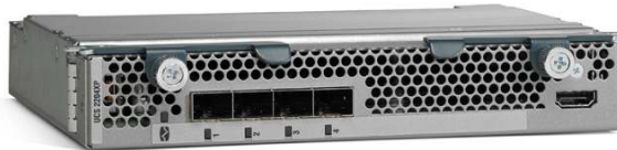
Figure 4. Cisco UCS 2204XP Fabric Extender

The Cisco UCS 2204XP Fabric Extender (Figure 4) has four 10 Gigabit Ethernet, FCoE-capable, SFP+ ports that connect the blade chassis to the fabric interconnect. Each Cisco UCS 2204XP has sixteen 10 Gigabit Ethernet ports connected through the midplane to each half-width slot in the chassis. Typically configured in pairs for redundancy, two fabric extenders provide up to 80 Gbps of I/O to the chassis.