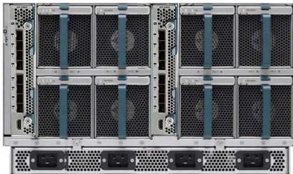
Figure 2. Rear of Cisco UCS 5108 Blade Server Chassis with Two Cisco UCS 2208XP Fabric Extenders Inserted

Cisco UCS 2200 Series Fabric Extenders fit into the back of the Cisco UCS 5100 Series chassis. Each Cisco UCS 5100 Series chassis can support up to two fabric extenders, allowing increased capacity and redundancy (Figure 2).