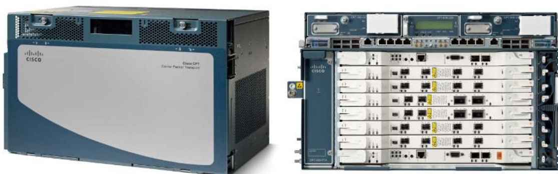
Figure 1. Cisco CPT 600 Carrier Packet Transport (with front cover (left), without front cover (right))

The CPT platform has great revenue potential for service providers by providing TDM like Ethernet Private lines as well as multipoint capabilities for Business, Residential, Mobile Backhaul, Data Center, and Video Services. These next generation of services can be readily deployed at low operational costs using the Cisco Transport Controller (CTC) and Cisco PRIME that allow fast and simple network turn up, A to Z provisioning and OAM features.