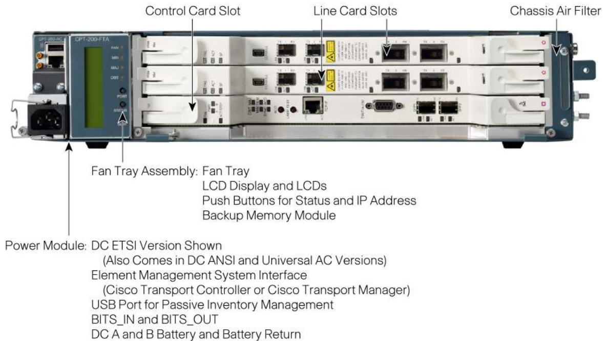
Figure 2. Cisco CPT 200 Modules

The Cisco CPT 200 provides capital and operational efficiency by addressing the increasing demand for bandwidth and multiple services at the edge of the network. It utilizes the existing Cisco Transport Controller management and integrates well with other optical transport platforms. With innovative technology, the Cisco CPT 200 pushes intelligence to the edge of the network, thus allowing the optimization of next-generation networks across multiple layers.