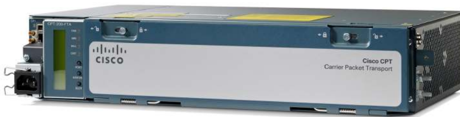
Figure 1. Cisco CPT 200 Carrier Packet Transport (with front cover (left), without front cover (right))

The CPT platform has great revenue potential for service providers by providing TDM like Ethernet Private lines as well as multipoint capabilities for Business, Residential, Mobile Backhaul, Data Center, and Video Services. These next generation of services can be readily deployed at low operational costs using the Cisco Transport Controller (CTC) and Cisco PRIME that allow fast and simple network turn up, A to Z provisioning and OAM features.