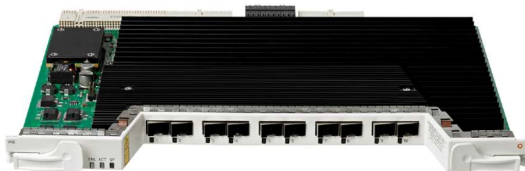
Figure 1. Cisco ONS 15454 10Gbps Optical Encryption Line Card

The encryption line card is a single-slot card that fits into the Cisco ONS 15454 MSTP M6 and M2 chassis, as well as the Cisco NCS 2006 and 2002 chassis. The card (part number: 15454-M-WSE-K9=) has 10 enhanced Small Form-Factor Pluggable (SFP+) ports that support five independent encryption streams, providing superb density for 10 gigabit encryption services.