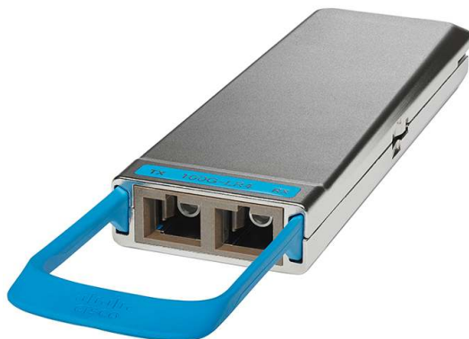
Figure 1. Cisco CPAK 100GBASE-LR4

The first product that Cisco is introducing that incorporates CPAK is the Cisco 100-Gbps DWDM Coherent Transponder Line Card. Due to its small size, CPAK can be integrated into the line card, eliminating a separate C Form-Factor Pluggable (CFP) client interface card. This effectively takes a two-chassis-slot solution down to