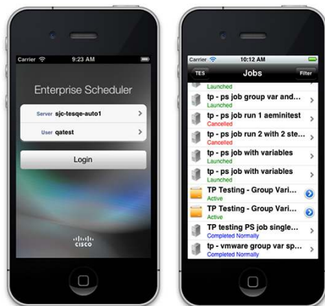
Figure 2. Mobile App Enables Cisco IT Engineers to Manage Workloads from Anywhere