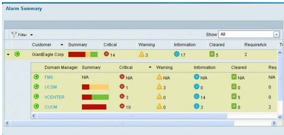
Figure 2. Alarm Summary Portlet

The HCM layer for service fulfillment (Figure 3) provides a common information model based on TMForum's SID (Shared Information Data) standard. This capability allows easy integration between the service management layer and the underlying domain managers.