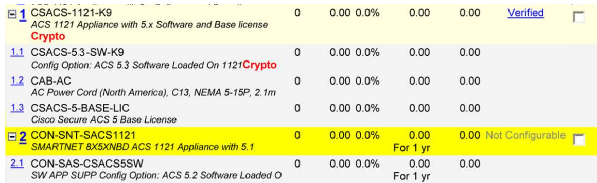
Figure 1. Ordering Example

Summary: Requires uses of MLC tool. SMARTnet is set on Line 2; SAS is set on Line 2.1 by using the “Set Service Options” capability.