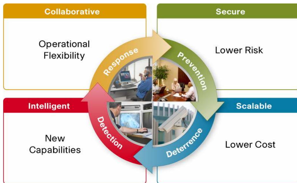
Figure 3. Network as Platform Reinvents Safety and Security

In addition to the Cisco Empowered Branch architecture for the branch office, which defines branch-office service integration, the Cisco Integrated Video Surveillance Solution is also a part of the Cisco Connected Physical Security Solutions Architecture, which uses the intelligent network as the platform for integrating diverse enterprise physical security and other applications into a single network and access device. This architecture supports the convergence of diverse applications such as security management and event correlation, access control, wired and wireless network connectivity, and unified communications and interoperability (refer to Figure 3).