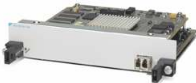
Figure 1. Cisco 1-Port OC-48c ATM SPA

The Cisco® Interface Flexibility (I-Flex) design combines shared port adapters (SPAs) and SPA interface processors (SIPs), taking advantage of an extensible design that helps enable service prioritization for voice, video, and data services. Enterprise and service provider customers can take advantage of improved slot economics resulting from modular port adapters that are interchangeable across Cisco Systems® routing platforms. The Cisco I-Flex design maximizes connectivity options and offers superior service intelligence through programmable interface processors that deliver line-rate performance. Cisco I-Flex enhances speed-to-service revenue and provides a rich set of quality-of-service (QoS) features for premium service delivery while effectively reducing the overall cost of ownership. This data sheet contains the specifications for the Cisco 1-Port OC-48c/STM-16 ATM Shared Port Adapter (1-Port OC-48c ATM SPA; refer to Figure 1).