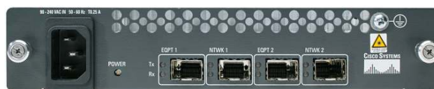
Figure 2. SFP Ports on the Transponder

The transponder effectively extends the range of client devices that can connect to the CWDM or DWDM network using pluggable optics: third-party SONET/SDH add/drop multiplexers (ADMs), storage and Ethernet devices, or Cisco platforms that do not support pluggable WDM optics can connect to the WDM network by using this transponder, which operates the wavelength conversion from older 850/1300/1550 nanometer (nm) signals to any CWDM or DWDM channels. This conversion is enabled by the WDM SFP ports sitting on the line side (Figure 2).