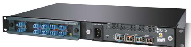
Figure 3. Cisco CWDM Chassis

Table 1 lists the compatible SFP optics required by each application.