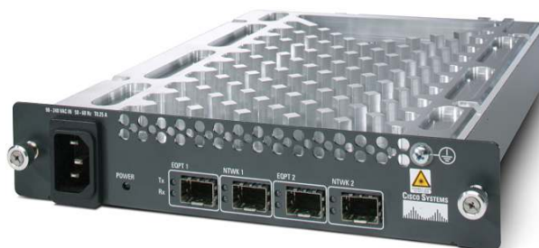
Figure 1. Cisco 2-Channel SFP WDM Transponder

The transponder effectively extends the range of client devices that can connect to the CWDM or DWDM network using pluggable optics: third-party SONET/SDH add/drop multiplexers (ADMs), storage and Ethernet devices, or Cisco platforms that do not support pluggable WDM optics can connect to the WDM network by using this transponder, which operates the wavelength conversion from older 850/1300/1550 nanometer (nm) signals to any CWDM or DWDM channels. This conversion is enabled by the WDM SFP ports sitting on the line side (Figure 2).