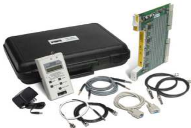
Figure 5 Turn-Up Test Kit Contents