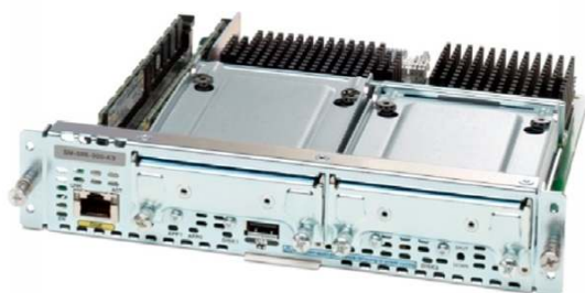
Figure 1. Cisco SRE Module

Cisco WAAS is a comprehensive WAN optimization and application acceleration solution that is a crucial component of Cisco Borderless Networks and data center and virtualization architectures. It accelerates applications and data over the WAN, optimizes bandwidth, empowers cloud computing, and provides local hosting of branch IT services, all with industry-leading network integration.