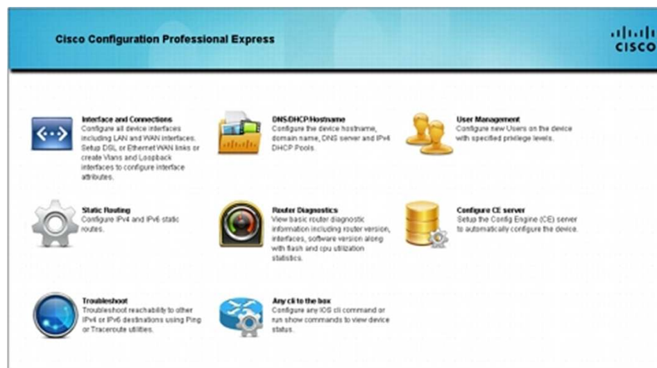
Figure 3. Cisco Configuration Professional: Wizard-Based Management

Group-based management features allow administrators to design security policies and authentication methods for each group, a feature that is essential when extending network resources to non-corporate-managed users and endpoints.