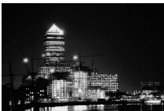
Citigroup's Financial Center under Development at Canary Wharf in London

most advanced network infrastructures in the industry. Prior to this date, the network hardware and software would be assembled and tested off-site at Cisco headquarters in San Jose, California in a complete network staging, simulation, and testing—one of the largest proof-of-concepts Cisco had ever undertaken.