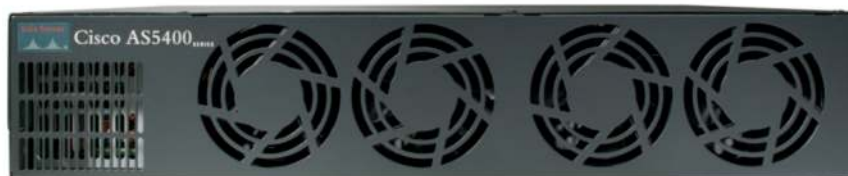
Figure 1. Cisco AS5400XM Universal Gateway

The Cisco AS5400XM Universal Gateway (Figure 1) doubles the performance of the Cisco AS5400 and delivers significant memory enhancements to offer high performance and high reliability in a compact, modular design. The Cisco AS5400XM High-Density Packet Voice/Fax Feature Card (AS5X-FC) and DSP Module (AS5X-PVDM2-64) available for the Cisco AS5400XM Universal Gateway enable higher-density configurations and world-class performance for intelligent packet voice services. The Cisco AS5400XM Universal Gateway (Figure 1) also supports existing Cisco AS5400 and AS5400HPX features, trunk termination, and universal port DSP feature cards in a more powerful chassis to help ensure continuing network investment protection. This cost-effective platform is ideally suited for service provider and enterprise environments that require innovative voice, fax, and data services.