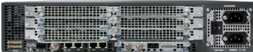
Figure 2. Cisco AS5400XM Universal Gateway Chassis View

The Cisco AS5400XM Universal Gateway provides all the system components that service providers have come to expect from carrier-class products as well as all the routing, WAN, and QoS features that are the hallmark of Cisco routing products. The Cisco AS5400XM uses a 750-MHz Reduced Instruction Set Computer (RISC) microprocessor with a 256-KB secondary cache and 512 MB of main memory. It offers the option of a redundant AC or DC power supply and has seven slots that can contain trunk and high-density packet voice/fax or universal port DSP feature cards. The Cisco AS5400XM architecture uses multiple data and control paths between feature cards and the motherboard to optimize media and signaling traffic for unparalleled performance (Figure 2).