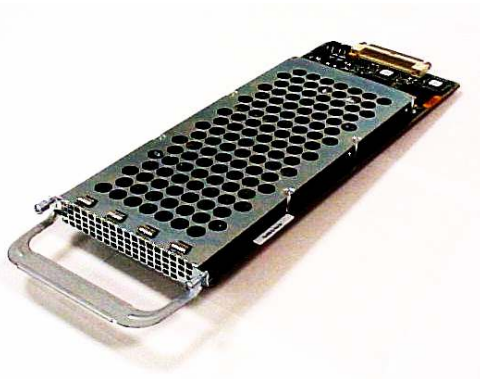
Figure 7. Cisco AS5400XM Universal Gateway 60- and 108-Universal Port Feature Card

The Cisco AS5400XM Universal Gateway 60- and 108-Universal Port Feature Cards are full-featured DSP-based cards that support 60 (on the former) or 108 (on the latter) voice, fax, and data calls. DSP-management features are available for troubleshooting, including DSP status, real-time call-in-progress statistics, DSP activity log, hard and soft busy out, and DSP firmware upgrade. Additional information can be obtained through the console, SNMP, or RADIUS accounting with the call-tracker feature (Figure 7).