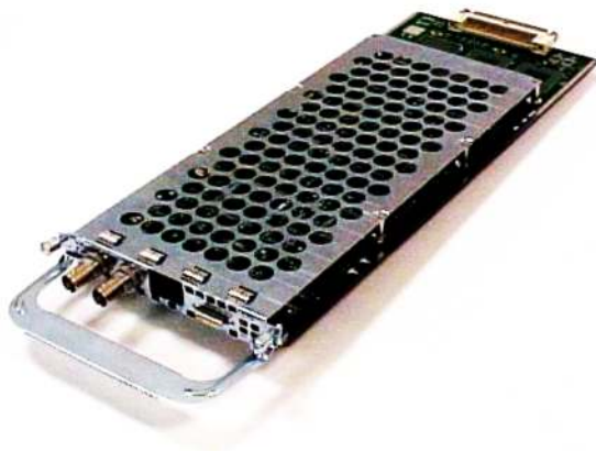
Figure 5. Cisco AS5350XM CT3A Termination Feature Card

When provisioned as a CT3 trunk, the CT3 interface cards provide physical termination for CAS, PRI, or IMT trunks, and include CSUs that connect directly to the telco network (Figure 5). The CT3 interface card provides physical-line termination for a CT3 ingress trunk line. It uses an onboard multiplexer to multiplex 28 CT1 lines into a single CT3 line. Nonintrusive monitoring of individual T1/E1 signals is available at the front of the T1/E1 termination card with standard 100-ohm bantam jacks.