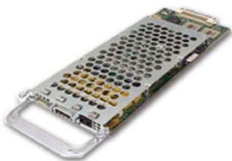
Figure 3. Cisco AS5350XM Universal Gateway 8-Port Termination Feature Card

The following is a brief description of the trunk types supported: