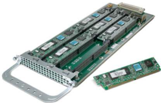
Figure 6. Cisco AS5350XM Universal Gateway High-Density Packet Voice/Fax Feature Card and DSP Module

It is easy to integrate the high-density packet voice/fax feature card and DSP module into existing Cisco AS5350XM Universal Gateway networks. The new feature card and DSP module operate on the gateway without any changes to the Cisco IOS Software configuration file in use for existing universal port DSP feature cards, making network upgrades simple. Current configurations are automatically updated.