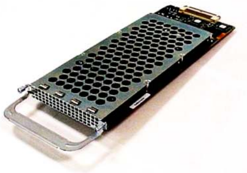
Figure 7. Cisco AS5350XM Universal Gateway 60- and 108-Universal Port Feature Card

The Cisco AS5350XM Universal Gateway 60- and 108-Universal Port Cards are full-featured DSP-based cards that support 60 (on the former) or 108 (on the latter) voice, fax, and data calls. DSP-management features are available for troubleshooting, including DSP status, real-time call-in-progress statistics, DSP activity log, hard and soft busy out, and DSP firmware upgrade. Additional information can be obtained through the console, SNMP, or RADIUS accounting with the call-tracker feature (Figure 7).