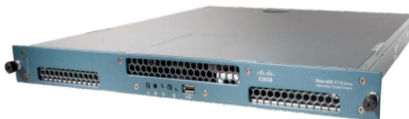
Figure 1. Cisco ACE4710 Appliance

The Cisco ACE4710 allows enterprises to accomplish these key IT objectives for application delivery: