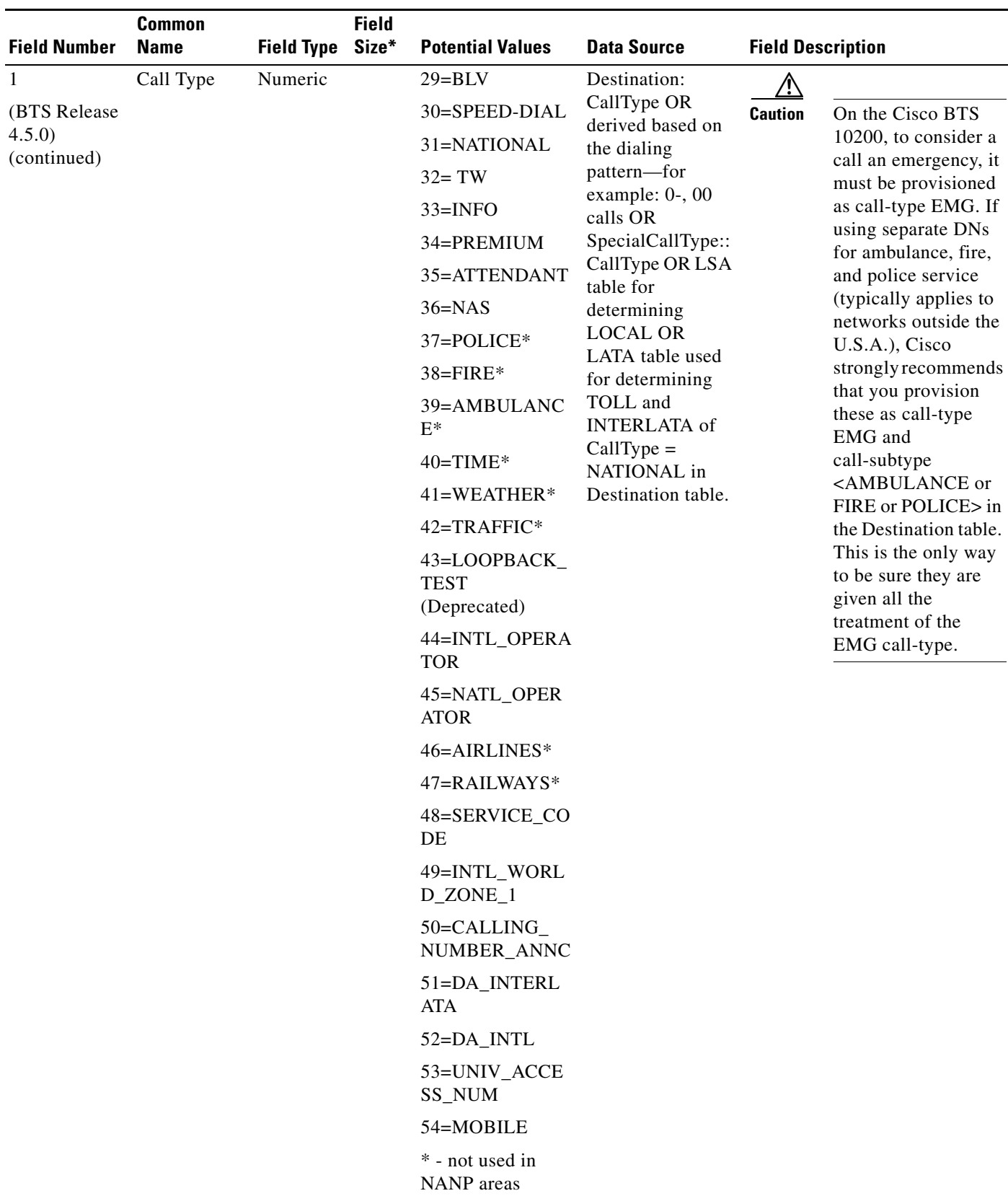
Table A-1 Call Detail Block Field Descriptions (continued)