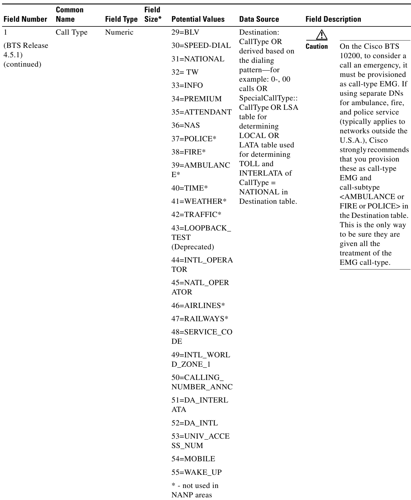
Table A-1 Call Detail Block Field Descriptions (continued)