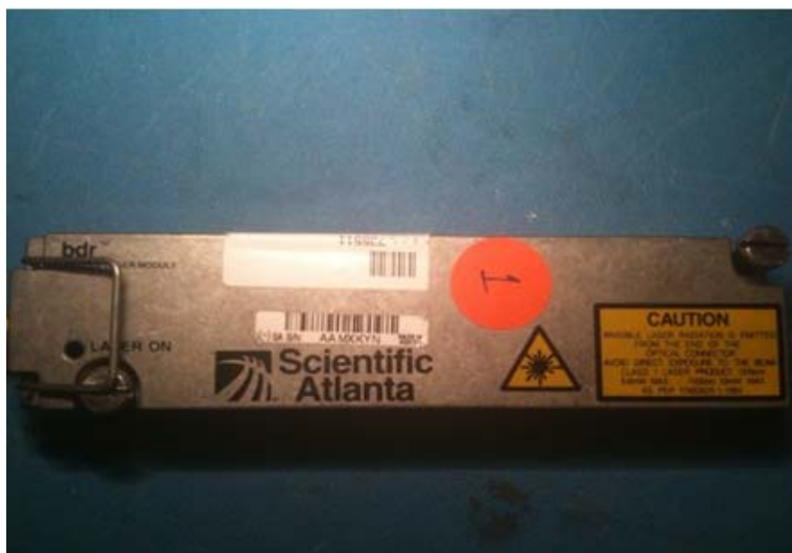
Illustration #5-2:1 BDR Transmitter

The following illustration shows BDR 2:1 transmitters ONLY. There is no access to view the capacitor with the cover installed. If the transmitters have date code D2009 - K2009 and they are listed under the affected part number series, return the module for service. Refer to Support Telephone Numbers (on page 10).