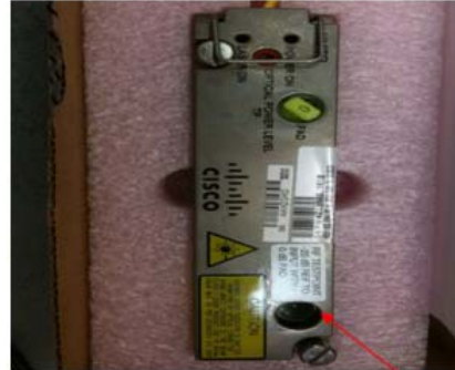
Illustration#2-Gain Maker / 694X Transmitter