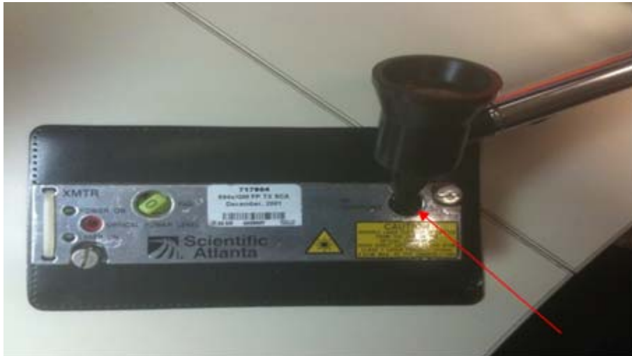
Illustration #7-6940 Tx

The following illustration shows the 6940 transmitter and the ostoscope used to inspect the capacitor. Capacitor location reference designator is C32.