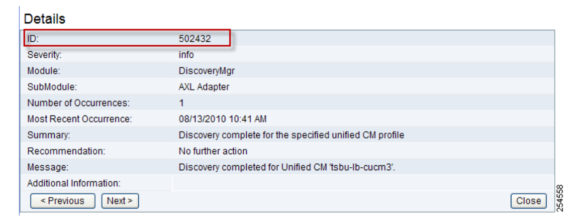
Figure A-2 System Messages Details Window

Each ID number corresponds to a software module that generates the system message. Table A-1 maps the ID number ranges to their respective software modules.