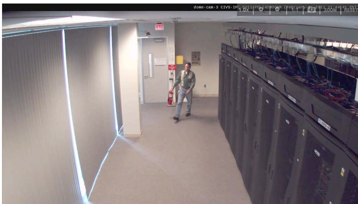
Figure 1. Cisco Video Surveillance 5000 Series HD IP Dome Camera (1080p) H.264

Cisco is offering new tools and resources to successfully deploy IP video surveillance on complex networks.