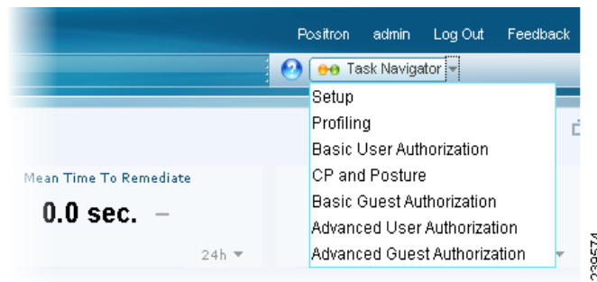
Figure 3-1 Task Navigator Menu

The Task Navigator menu appears in the upper right corner of the Cisco ISE window.