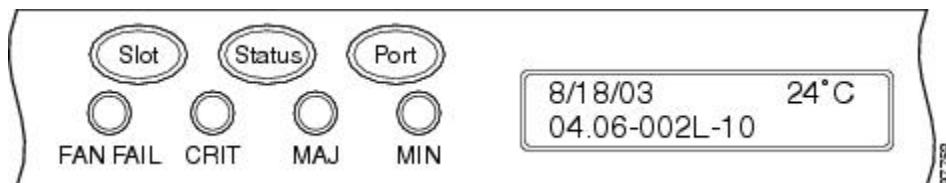
Figure 1: Shelf LCD Panel