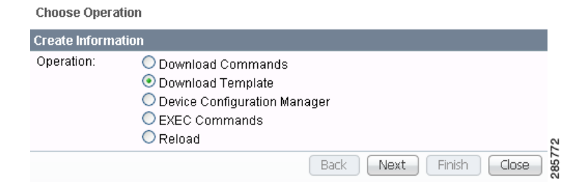
Figure 13-3 Device Console – Download Template: Select Devices

A window appears as shown in Figure 13-3.