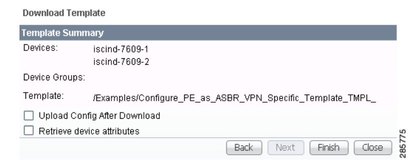
Figure 13-7 Download Template Summary