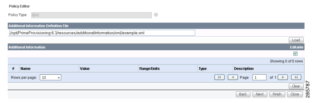
Figure E-1 Additional Information Window

This window is the second to the last window of the policy workflow, and it appears before the Template Association window.