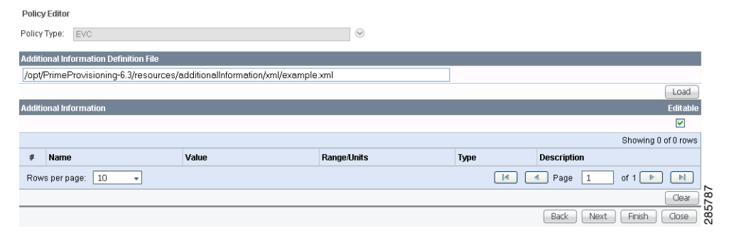
Figure F-1 Additional Information Window

This window is the second to the last window of the policy workflow, and it appears before the Template Association window.