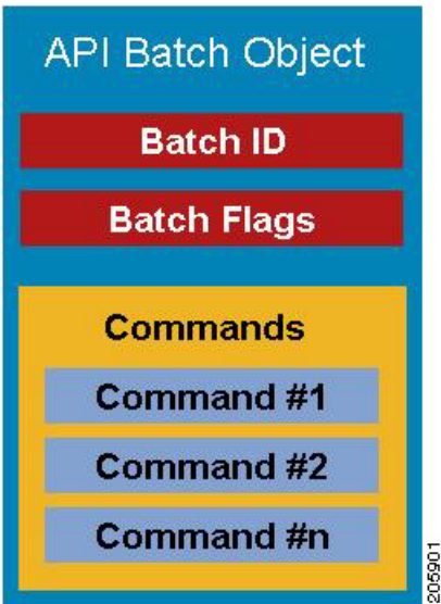
Figure 4-1 API Batch Object

Figure 4-1 illustrates the concept of batch processing.