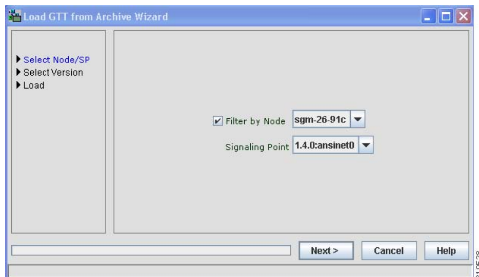
Figure 14-4 Load GTT from Archive Wizard

The Load GTT from Archive wizard appears.